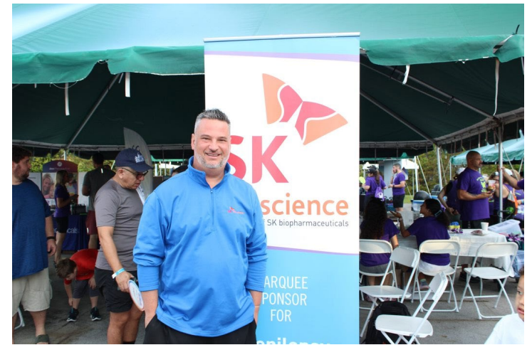
Photos of Pull Up Sign

Submit the NAME OF YOUR EVENT: DATE OF THE EVENT: NUMBER OF PEOPLE AT THE EVENT If there were any SK representatives at the event – please include their names as well.