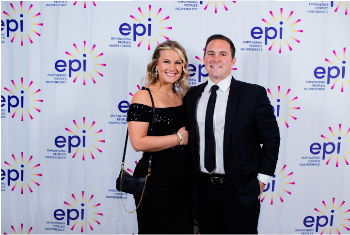
Photograph of SK reps at an event