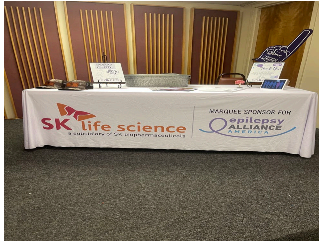
Photo of SK tablecloth